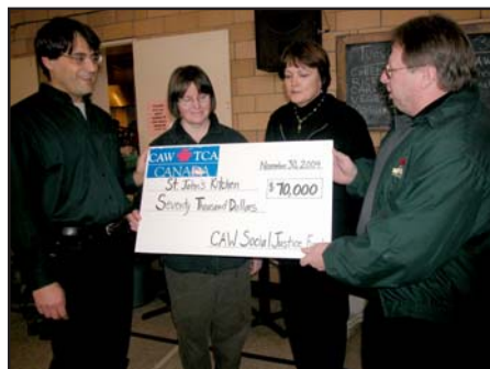
The Working Centre is presented with a $70,000 donation from the CAW Social Justice Fund